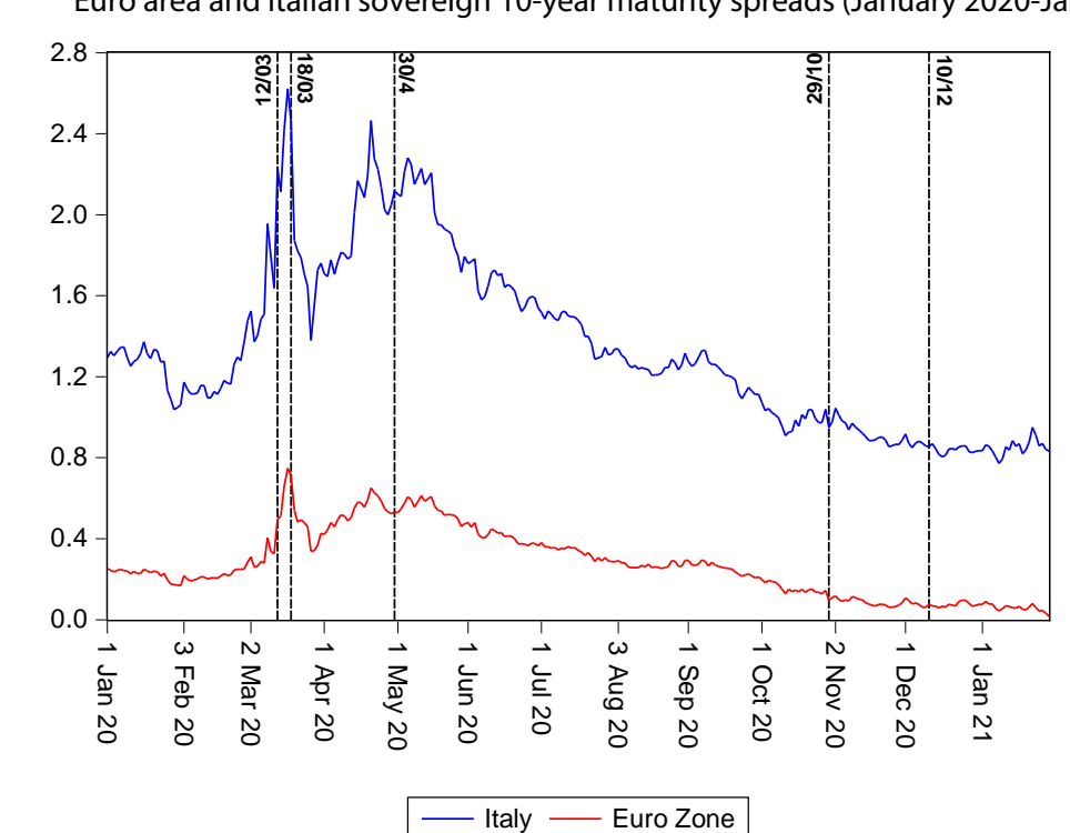
Figure 4: Euro area and Italian sovereign 10-year maturity spreads (January 2020-January 2021)