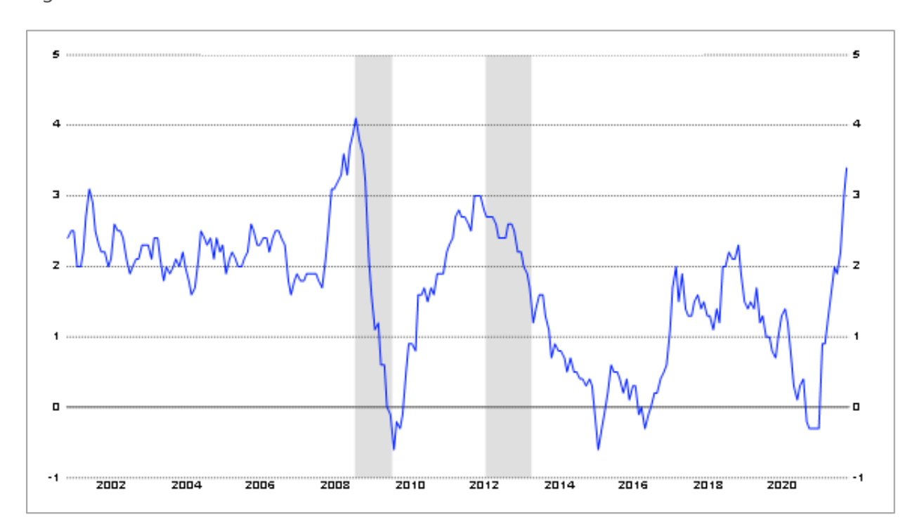
Figure 1: Euro area annual HICP inflation rate

Since the 2003 strategy review, important factors have challenged the world economy and the euro area's economic system: the strengthening of globalisation, the 2007-2008 global financial crisis, the European sovereign debt crisis, and the most recent COVID-19 shock. All these factors have concurred with the changes that largely justify the new 2021 strategy review. In fact, they have significantly contributed to an important macro fact that is related to an unobservable but key policy variable: the fall in the natural rate of interest. In turn, this fall is understood to have been at the root of two other macro facts relating to observable variables:namely, a subdued inflation rate which has averaged 1.6% in the euro area since 2007 (see Figure 1), and a long stay (since mid-2014) of policy rates at the (effective) ZLB.